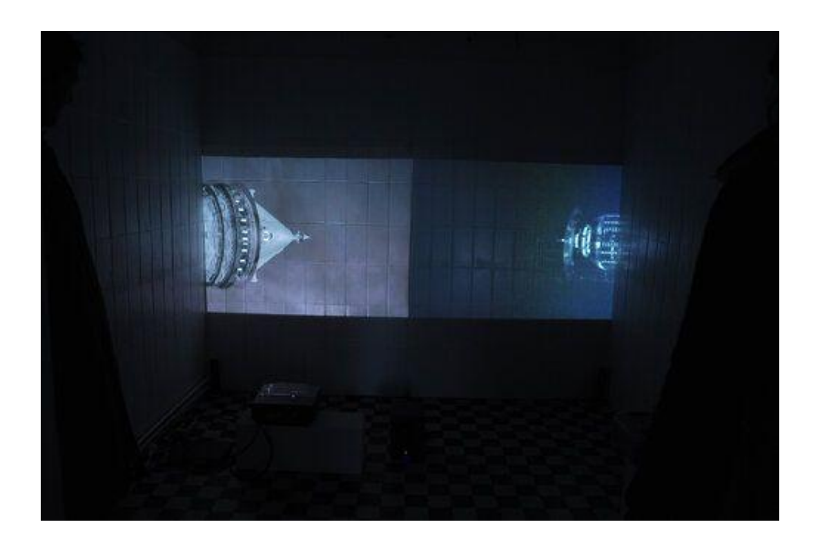
DAY AND NIGHT Installation work