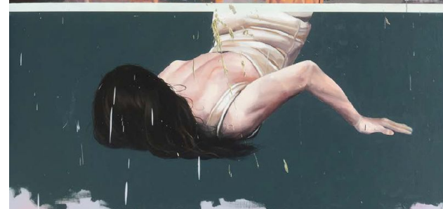
WHO WILL CUT THE MOONLIGHT?