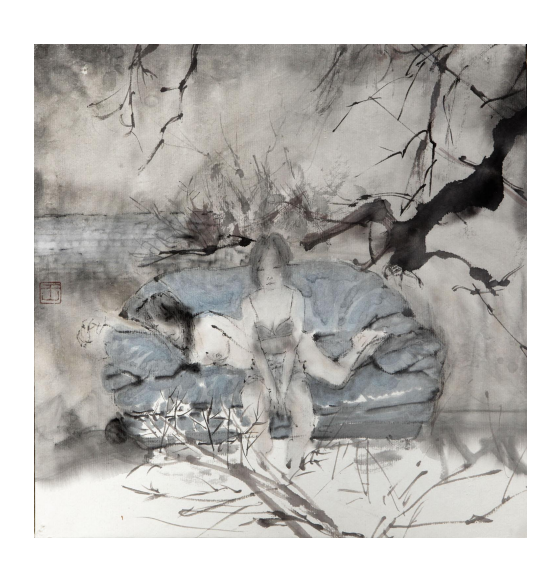
SECRET GARDEN SERIES