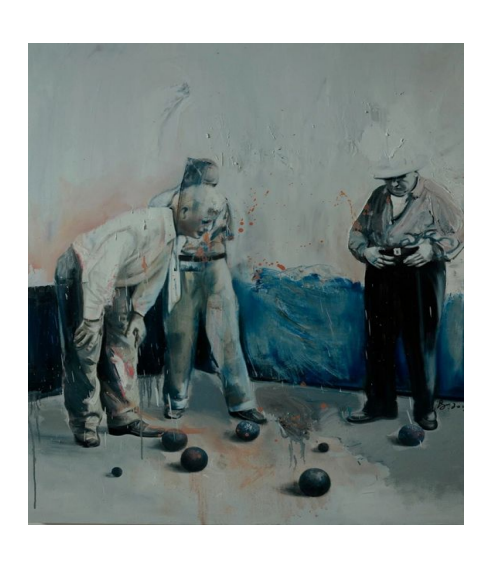
BALL IN WRONG DIRECTION