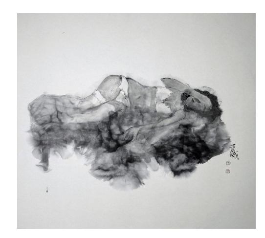
Laying Girl 3 Ink on paper 192x180cm 2014