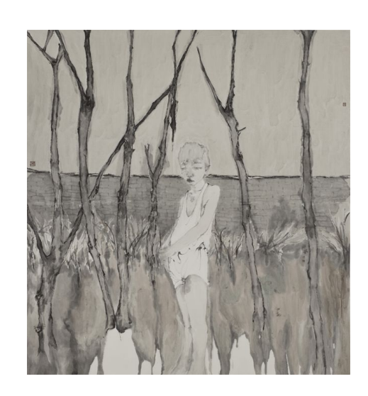
SECRET GARDEN SERIES