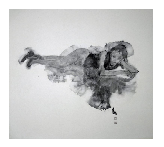
Laying Girl 1 Ink on paper 192x180cm 2014