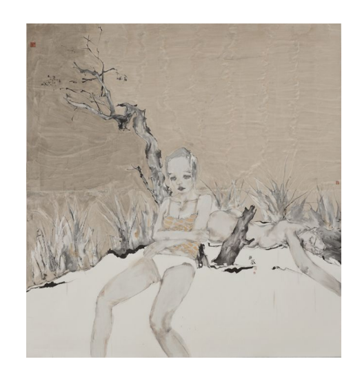
SECRET GARDEN SERIES