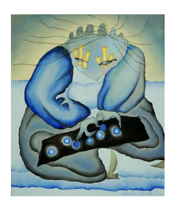
MONSTERS IN MY HEART