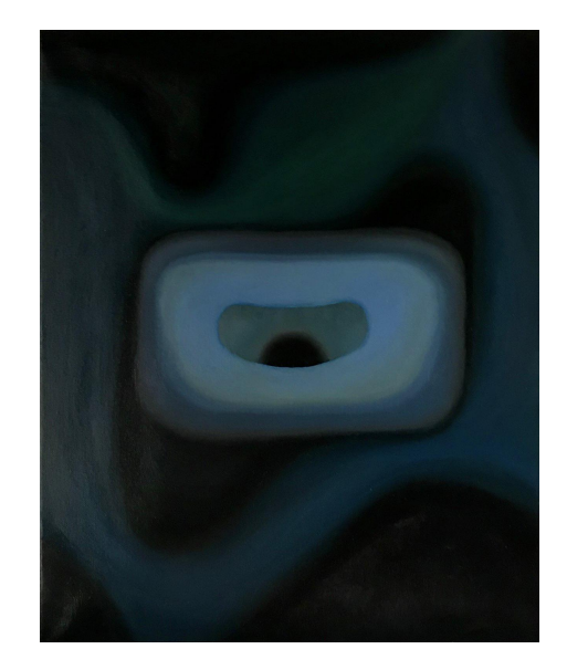
THE PILLOW (DETAIL)

Oil painting and glass sculpture Canvas: 40x50cm, 2020 Glass: 10x15x25, 2020