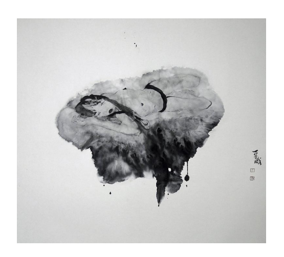
Laying Girl 2 Ink on paper 192x180cm 2014